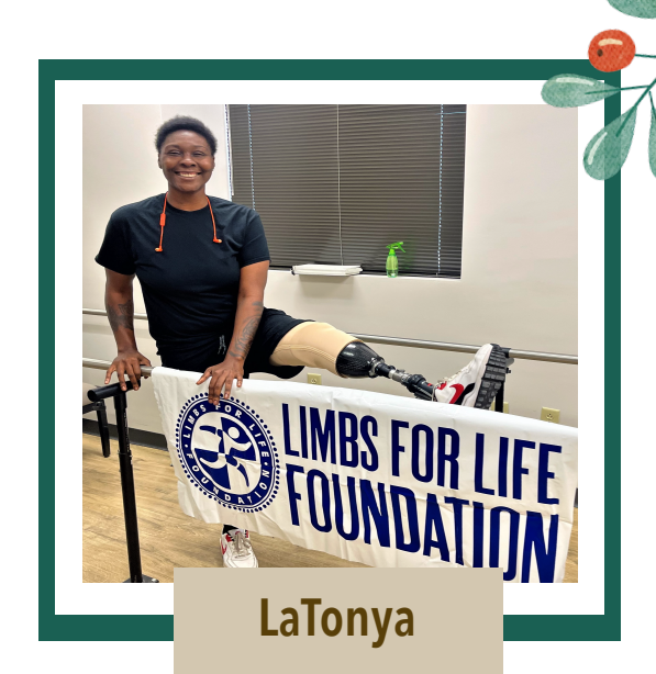
Age 34, Georgia Hanger Clinic-Augusta