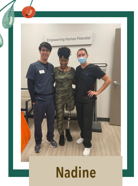
Age 49, Florida Hanger Clinic-Ft. Lauderdale

Gifts come in all shapes and sizes! Did you know you can give to Limbs for Life out of your investments?